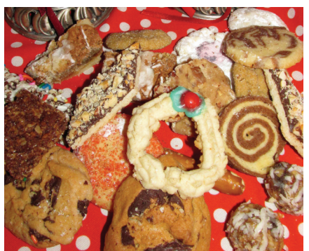
table of homemade cookies and treats and enjoyed admiring and sampling from the many choices.

After the wrapping was completed, members surrounded the